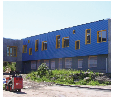
Top three and bottom left photographs were taken "before and during" and the bottom center and right were taken "after" the work was completed.