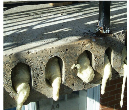
Top three photographs were taken "during" and the bottom three were taken "after" the work was completed.