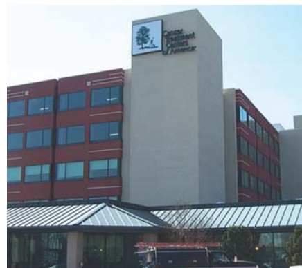
Top left and center photographs were taken "before" and the top right and bottom three were taken "after" the work was completed.