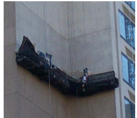
Top three photographs and bottom left are "before" and "during"; the bottom center and right were taken after the work was completed.