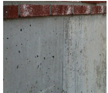
Top three photographs were taken "before" and the bottom three were taken "after" the work was completed.